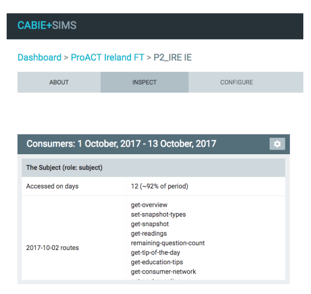
Figure 2 - Stakeholder Engagement with System viewed by PwM

The outputs of this analytic are generated on demand. Currently, trial site administrators and research teams can generate outputs relating to a single PwM (inclusive of their care network) through SIMS. Interface elements which will allow generation across a trial site are currently in development. These are expected to be in place by end of the main PoC trial's first action-research cycle (with partial implementations in place for the start of the main PoC trial).