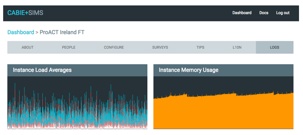
Figure 3 - Resource Utilization Graphed over a 7 Day Period

Test systems for the Friendly Trial were deployed on low-powered, single-core VPSs. Because of this, a single procedure which struggled with low RAM availability was discovered, in part due to the analytics employed in this category. This discovery allowed the development team to optimise the procedure in question, to remove the requirement for higher RAM availability.