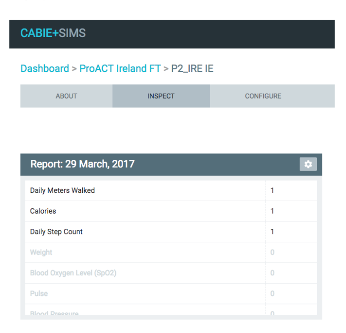
Figure 1 - Inspecting Number of Inputs by Type for an Individual on a Given Day

For the duration of the Friendly Trial, a daily email was generated for Trial Site administrators which identified the number of inputs received by the system in the proceeding day, broken down by data type, and by data source (which device provider they had come from). This email reported on missing data points across a full trial site, rather than reporting by individual.